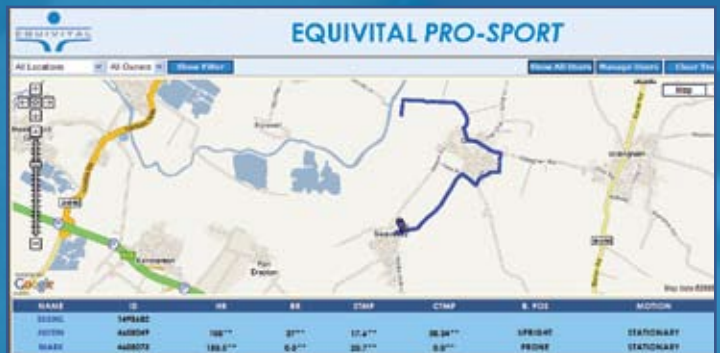
Live web monitoring of performance during races and other competitive events

At the end of this session we will design a detailed proposal which demonstrates how your organisation can get maximum benefit from the Pro-Sport Club System . The system can be as small or as integrated as you like - you decide.